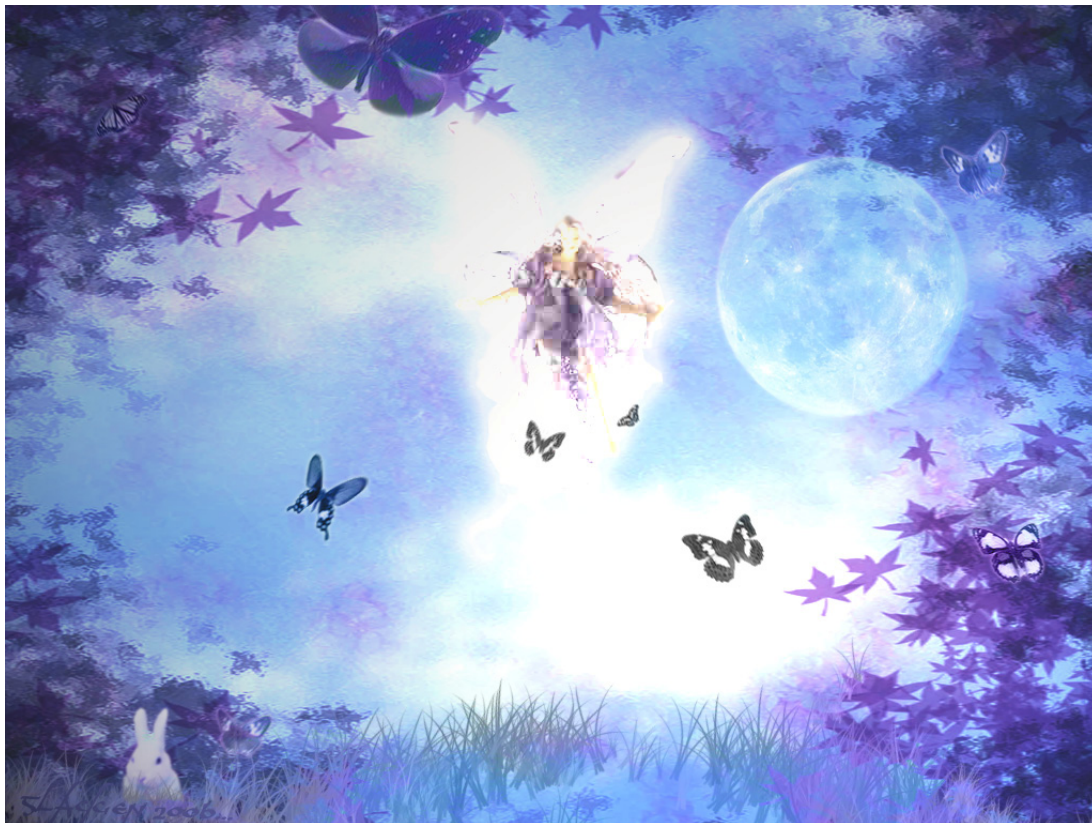
"Butterflies" created by Revenant aka Slaygen